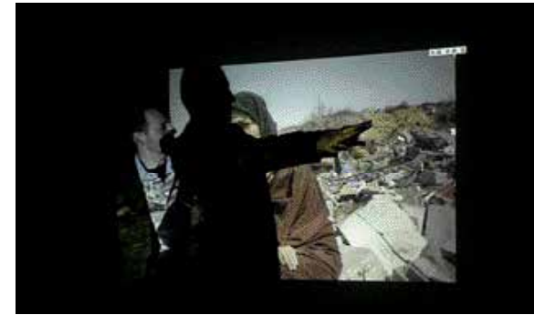
Fig. 8. (below) Richard Goldstone’s press conference in Gaza, June 4, 2009. This image is perhaps one of the best demonstrations of the principles and potential problems of forensic architecture. Goldstone, heading a UN commission of inquiry into the Israeli attack of Cast Lead (2008–2009) stands in front of a destroyed multistoried building. Goldstone was worried that the credibility of the witnesses in Gaza would be politically questioned and turned the attention of his report to material things. Buildings here stood for the absence of witnesses. Around Goldstone are members of the government in Gaza; before them stands a bouquet of microphones belonging to international news networks. But since the ruined building cannot speak for itself, Goldstone speaks on its behalf to an international forum.