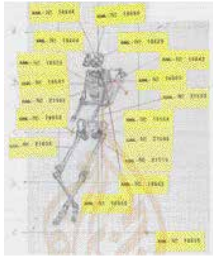
Fig. 13. Labeling and location of the collected specimens taken from Yasser Arafat’s body upon his exhumation on November 26, 2012. Source: “Swiss forensic report on Arafat’s death,” Al Jazeera, last updated November 6, 2013, http://www.aljazeera.com/investigations/killing-arafat/swiss-forensic-report-arafat-death-201311671255163780.html .