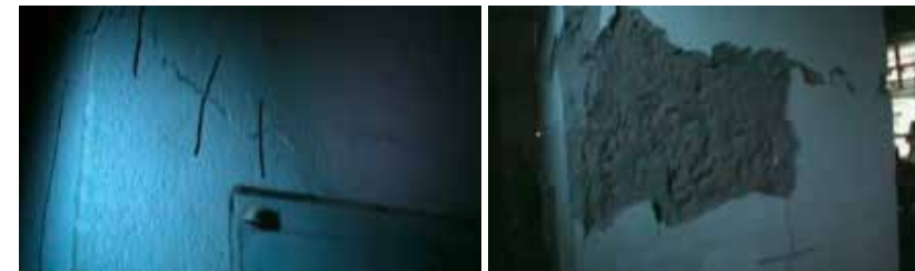
Figs. 3, 4. Stills from a Dhaka police video showing building surveyors' markings over the crack (image on the left) in one of Rana Plaza's walls, Savar, Dhaka area, April 23, 2013 (a day before the collapse).

When architectural surveyors study cracks or other aspects in the structural pathology of a building, they tend to interpret their findings in relation to a narrowly circumscribed set of conditions. They trace material deformations back to force, but in this they have reached the limit of their epistemic frame. Forces are rarely linked back to their multiple political causalities. Such was the case in the trials concerning the responsibility for the collapse of the Rana Plaza factory in Savar near Dhaka. On April 23, 2013, a crack appeared in the floors and walls of the building used by garment industry sweatshops. Municipal building inspectors ordered the closure of the factory. But a crack is merely the potential for something to occur. Whether it will tear a building apart or just linger there for years is a matter of probability. The Rana Plaza factory owners, hard pressed to deliver cheap fashion products to Western labels, assessed the risk of collapse and the potential deaths of their workers in relation to the risk of losing a lucrative contract due to delays in production. They disregarded the warnings and forced the workers to return on the following day (the senior management was not based in the building). The workers, without voice or choice, entered the building at 8 a.m.; at 9 a.m. the crack expanded, cutting furiously through it. More than a thousand people—mostly women earning less than $40 a month to produce our clothes—died in the rubble.